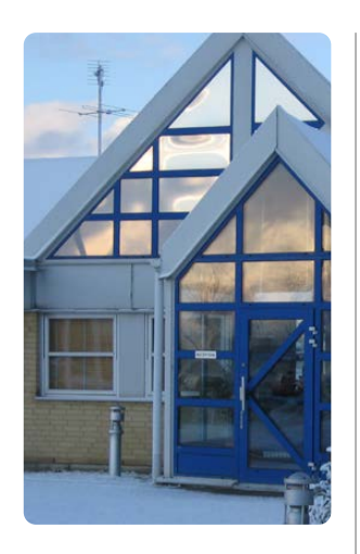
HemoCue at a glance 4 Human Rights